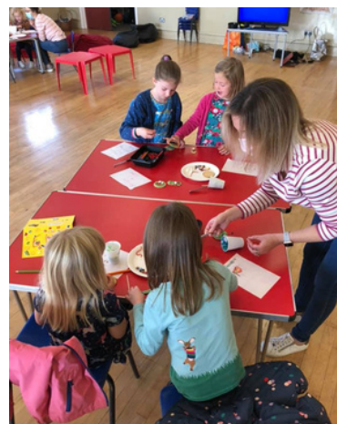
Everyone enjoying Dive In Week at Kidzone