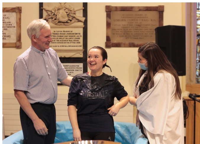
One of our young people who was baptised and confirmed on the same day