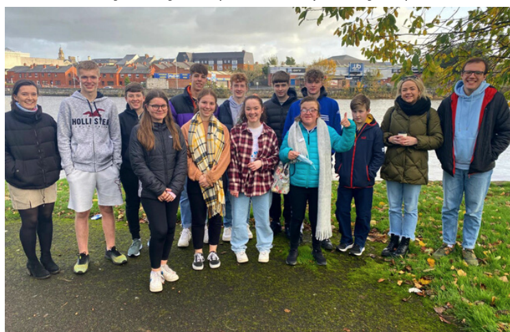
Our young people on their confirmation weekend