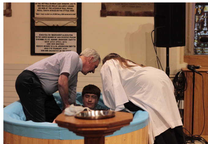
Some young people opted for full immersion baptism