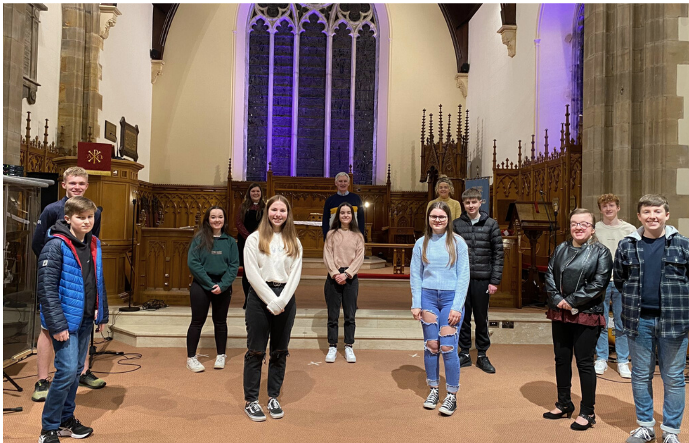
Some of our recently confirmed young people after their first communion on Sunday 28th November

We meet each Saturday night for games, tuck shop, our Youth Alpha Course and some banter! Starting from Saturday 4th December we are starting our Christmas Nights at Mettle. We will be having a Christmas Baking Night and Movie Night.