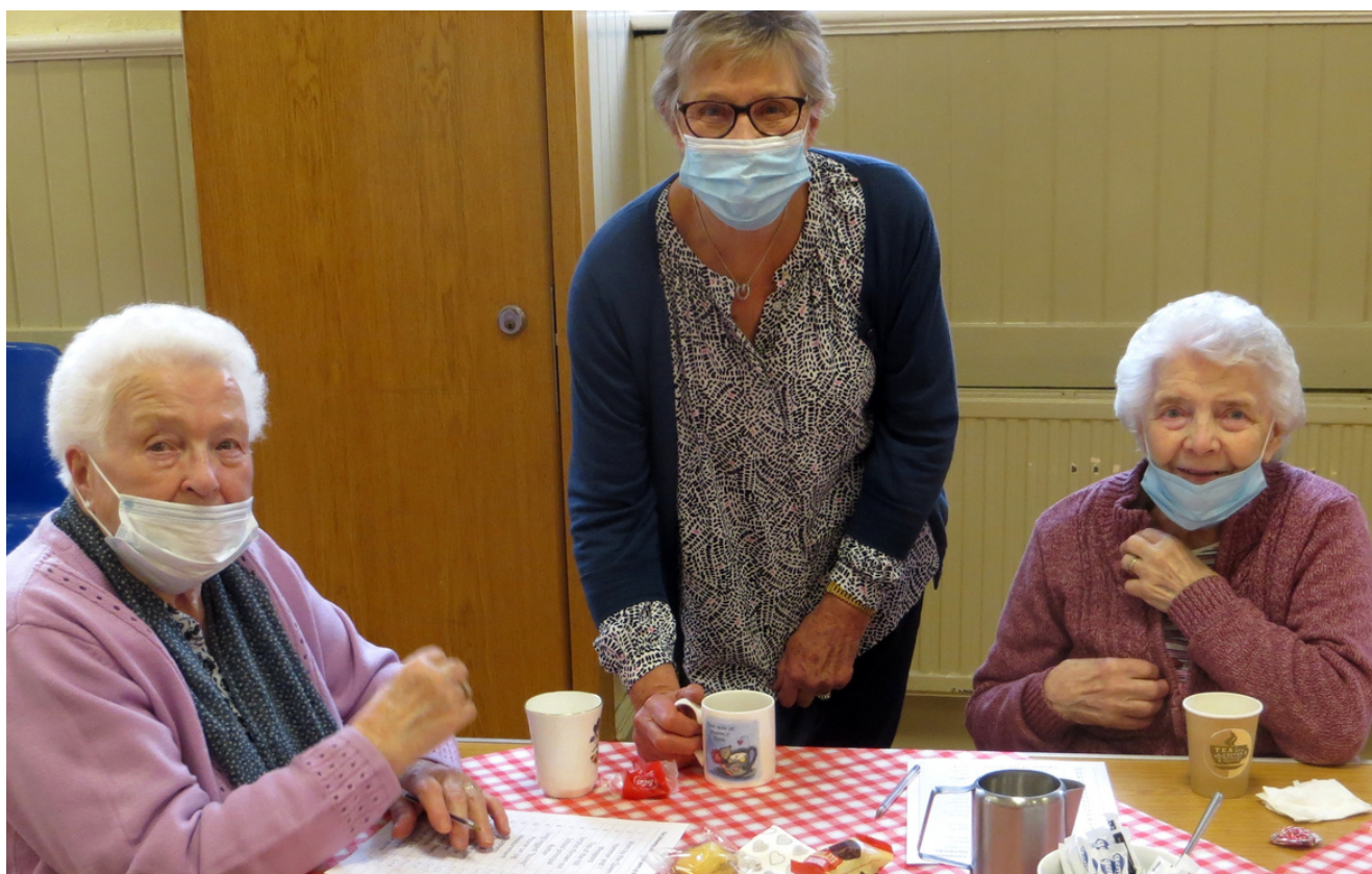
There's nothing better than a cup of tea and a chat with friends!

Cameo plans to restart on 13 January 2020 at 2.30 pm DV, and we are always delighted to welcome new members along!