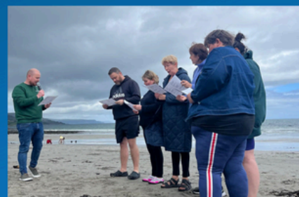
Baptisms and and Renewal of Baptismal Vows