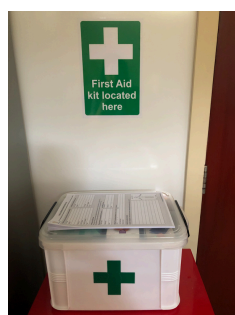
LOCATED IN HALL KITCHEN

There is an Accident /Incident reporting form which covers all age groups. These can be found beside the first aid kits and completed as necessary and returned to Angela in the office.