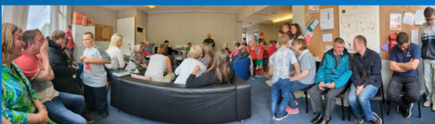
Chit Chat Church