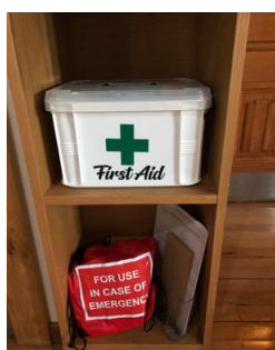
LOCATED IN CHURCH

Can we kindly ask if anyone uses any items out of these that you notify Angela Montgomery in the office so that items can be replaced. This will ensure they will always be fully equipped and ready for any emergency.