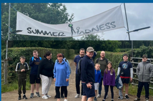
Summer Madness with Connect Youth